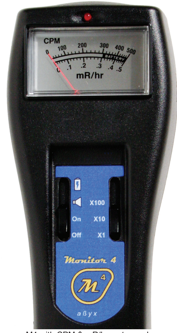
M4 with CPM & mR/hr meter scale

Analog Meter holds full scale in fields as high as 100X maximum reading. CPM & mR/hr scale. Optional SI Scale Meter Available