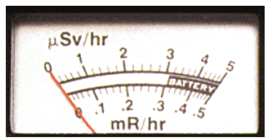
Optional SI Meter Scale: 0-500 µS/hr & 0-50 mR/hr