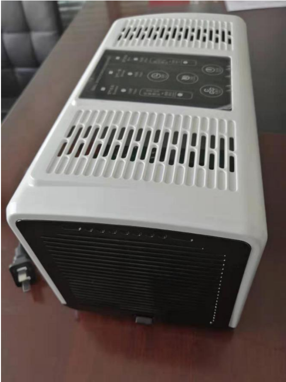
YX-007-SK 主机 1 台