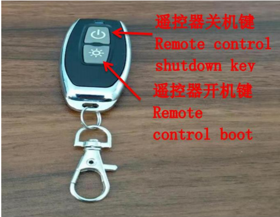
图 2 Figure 2