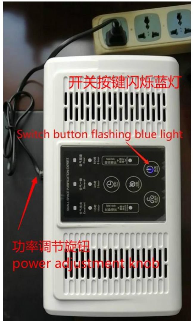
图 1 Figure 1

The power supply is inserted into the wire plug, and the switch button flashes blue light, indicating that the equipment has been connected to the power supply. (refer to Fig.1)