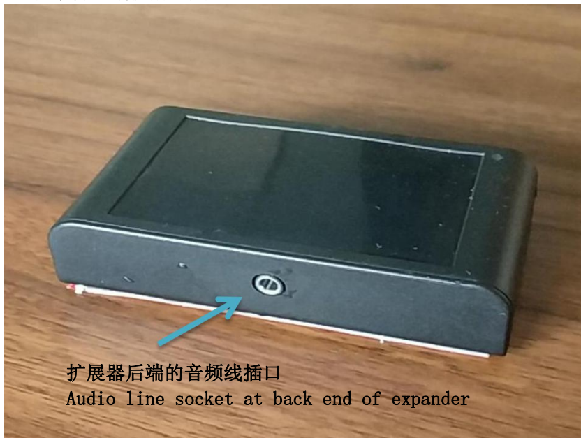
扩展器后端的音频线插口 Audio line socket at back end of expander