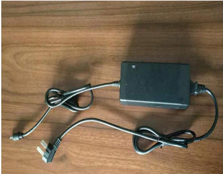
电源适配器 1 个