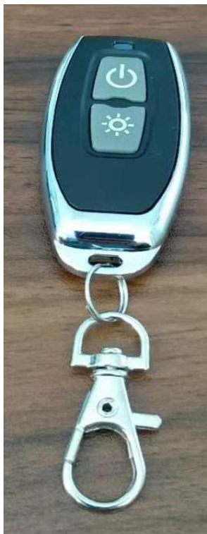
遥控器 1 个