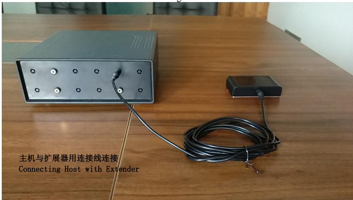
主机与扩展器用连接线连接 Connecting Host with Extender

Connect the host to the extender. The wiring method is as follows