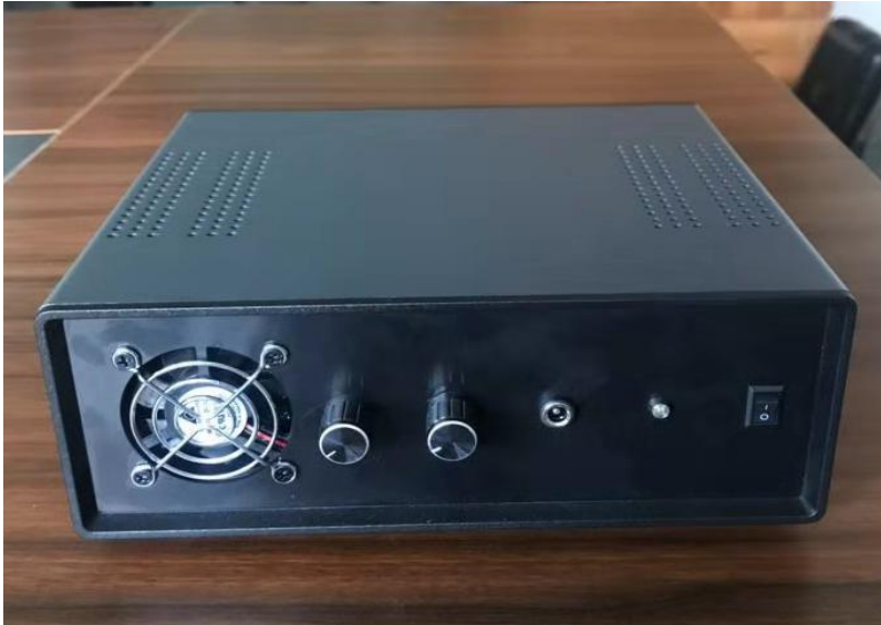
YX-007-FX(X=4/6/8/12)主机 1 台